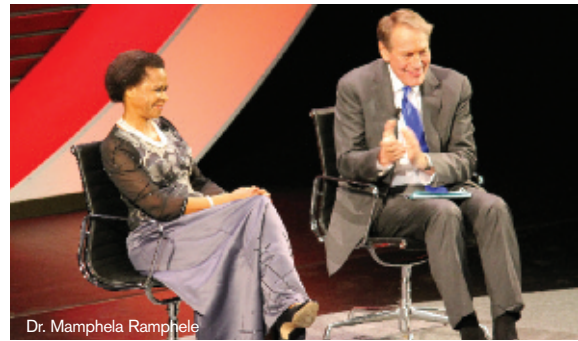
Dr. Mamphela Ramphele