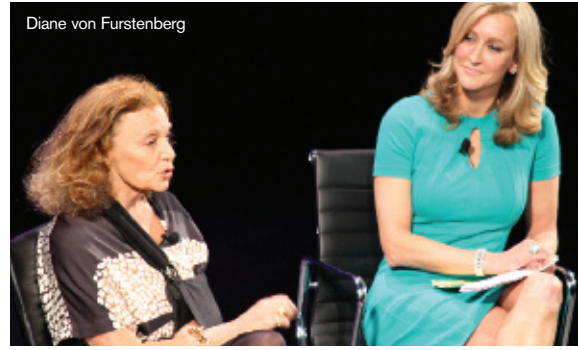
Diane von Furstenberg